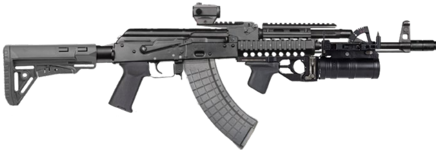
PAC103 WITH GP34 GRENADE LAUNCHER