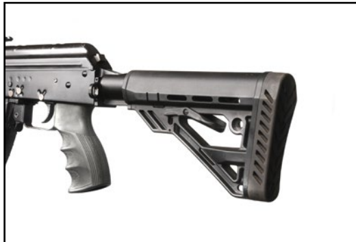
PAC103 can be fitted with any type of Mil-Spec AR stock.