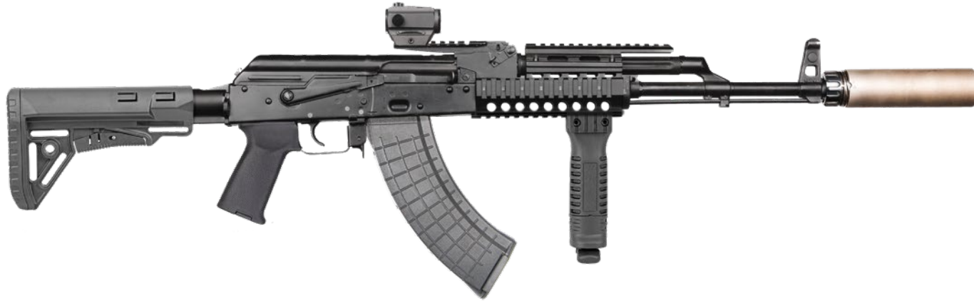
PAC103 WITH ALUMINIUM HANDGUARD WITH PICATINNY RAILS RED DOT MOUNTED ON RAIL IN PLACE OF REAR SIGHT