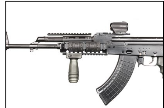
Front rail can be equipped with various types of front grips to enhance weapon control.

NOTE: Accessories can be bought separately and are not part of PAC103 / PAC103S set.