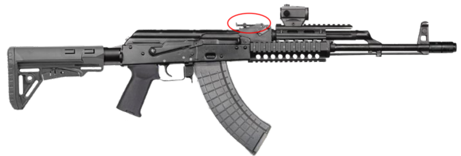
PAC103 WITH STANDARD REAR SIGHT WITH RED DOT MOUNTED ON FRONT RAIL