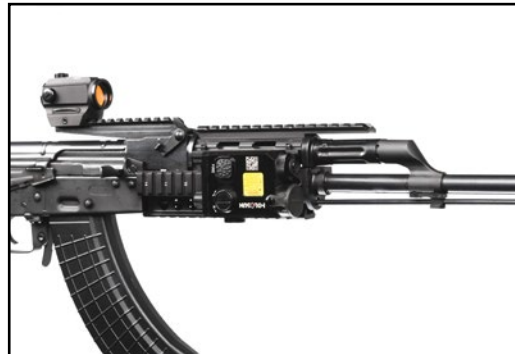
Presented with LS321 Laser Device