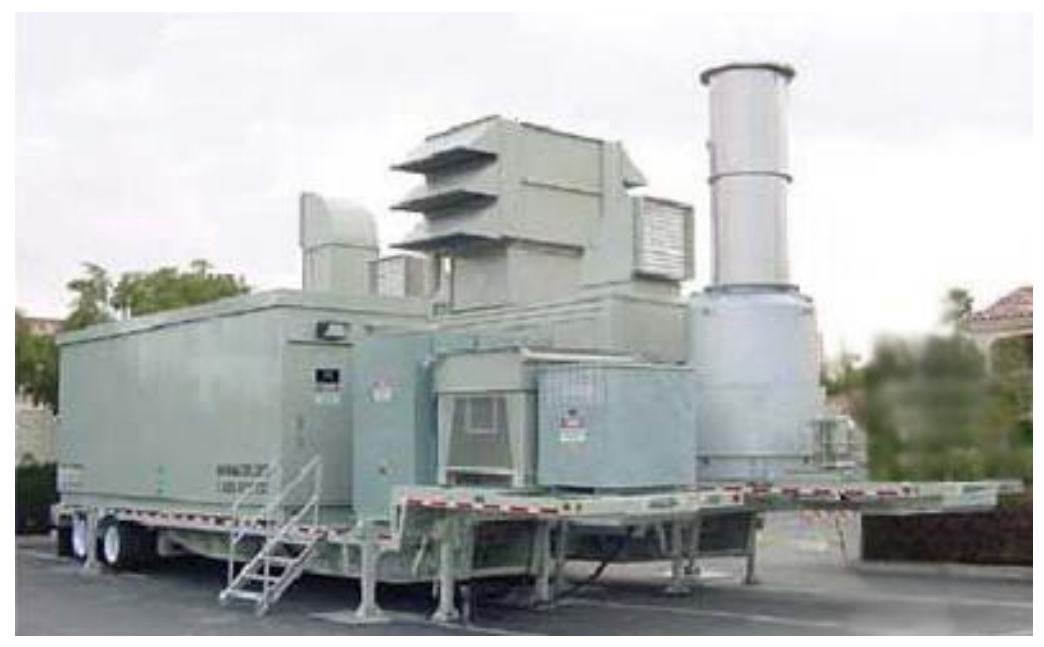
Taurus 60 Turbine Generator Set