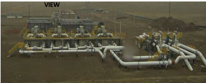
TYPICAL PUMP STATION ELEVATED VIEW