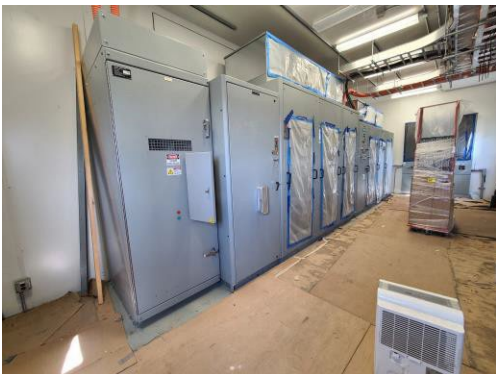
6500 HP 6900 Volt Siemens VFD