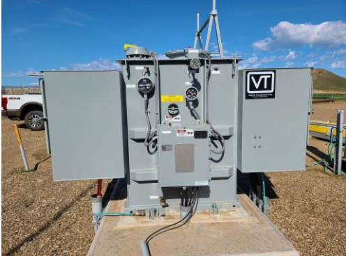
600 kVA TRANSFORMER