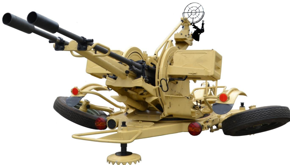
Photo.2. The 23 mm the ZU-23-2 Twin Anti-Aircraft Cannon (front view).