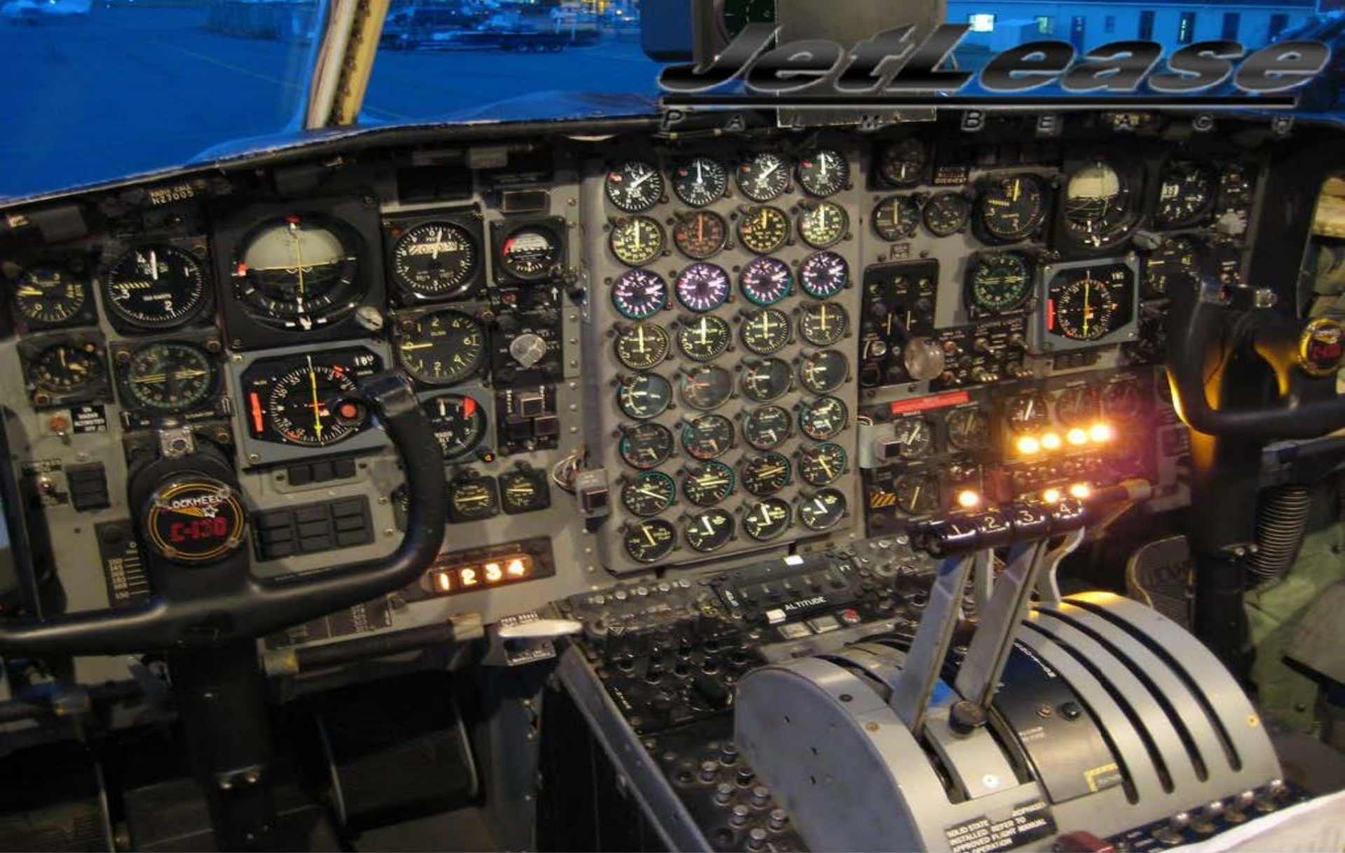
1962 Lockheed C-130E