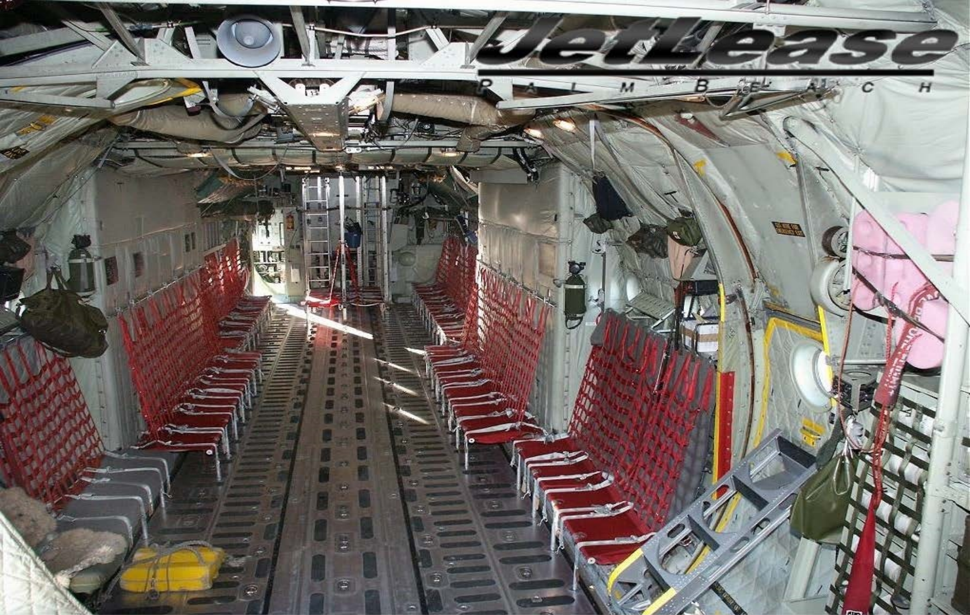
1962 Lockheed C-130E