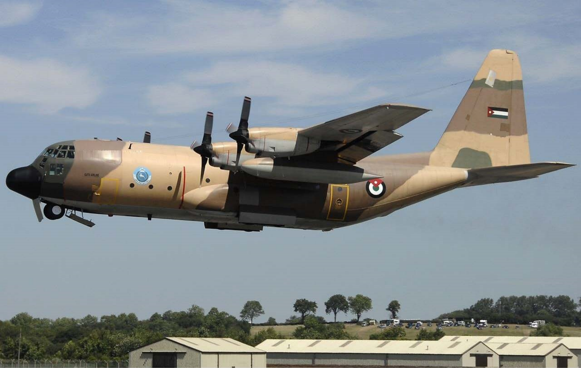
1962 Lockheed C-130E