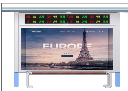
02/ Light Box