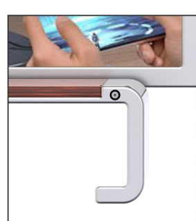
03/ Charing Port