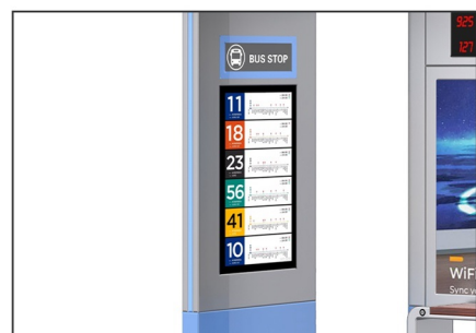
01/ Light Box